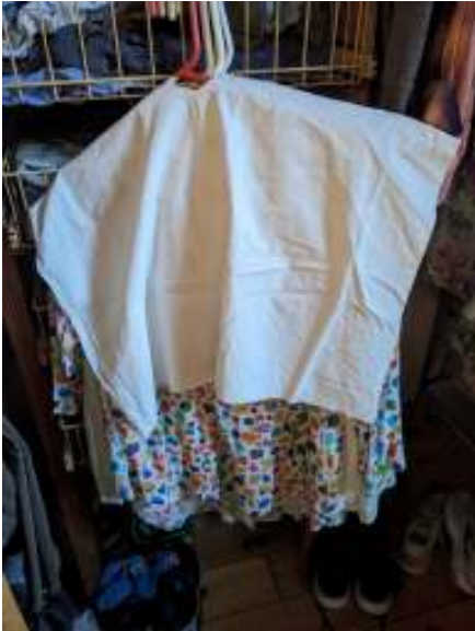
- Camille Hall