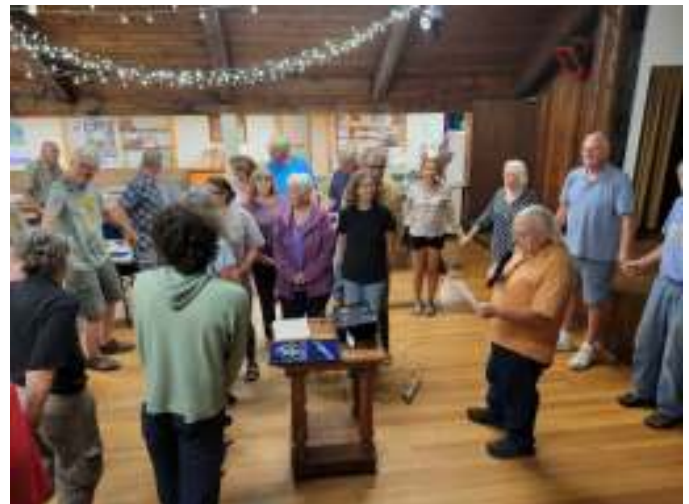
Welcoming ceremony in September for new MRG members.