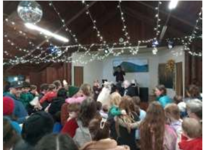
Numerous family-friendly activities at Marys River Grange hosted by Maxtivity, Philomath's nonprofit arts and crafts creative space, on New Year's Eve included the appearance of Caesar the "No Drama Llama." The event was a great success!