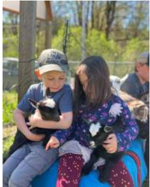
Baby goats were most popular with everyone.