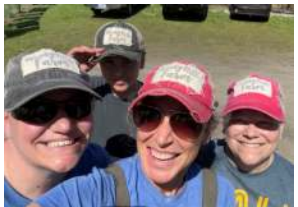
Thank you, Windy Hill Farm crew!