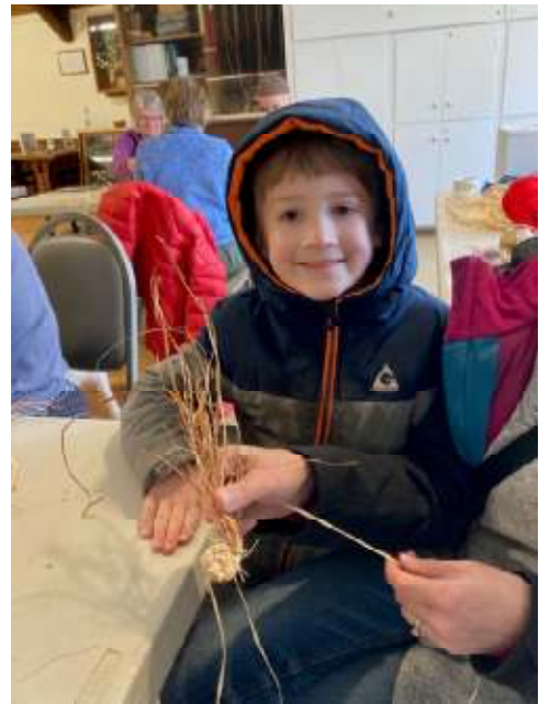
We had good help.