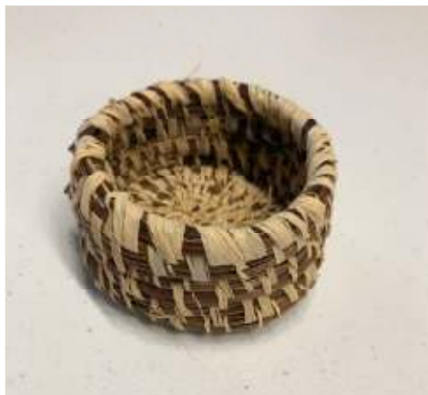
Theo's first basket

Marys River Grange #685 regularly meets on the first Wednesday of each month at 7 PM at 24707 Grange Hall Road in Philomath and via Zoom. Potluck at 6:30.