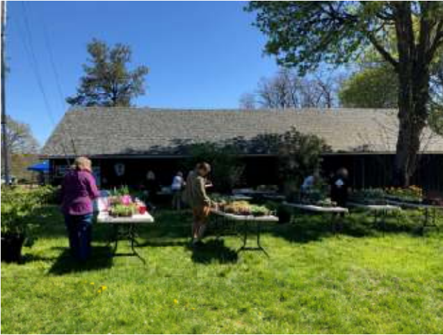
Beautiful day at MRG, with many donations to benefit the Philomath Community Garden